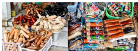
Photo 3 Kitsch in Bali.jpg 192K