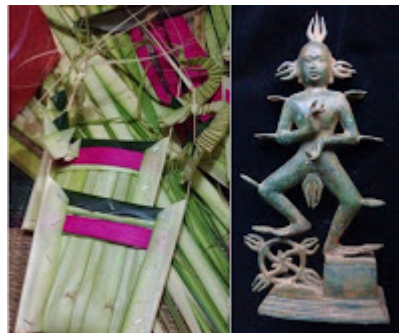
Photo 2 An example of jejahitan and pratima Acintya.jpg 98K