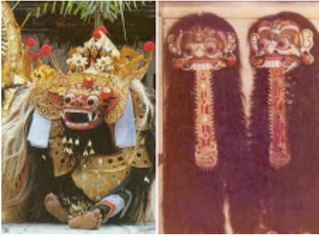
Photo 4 Barong and rangda—kriya in the concept of rwa bhineda (good and evil)..jpg 182K