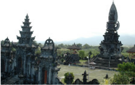
Photo 5 Temple that is Sthana (dwelling place) of Ida Sang Hyang Widhi Wasa.jpg 307K